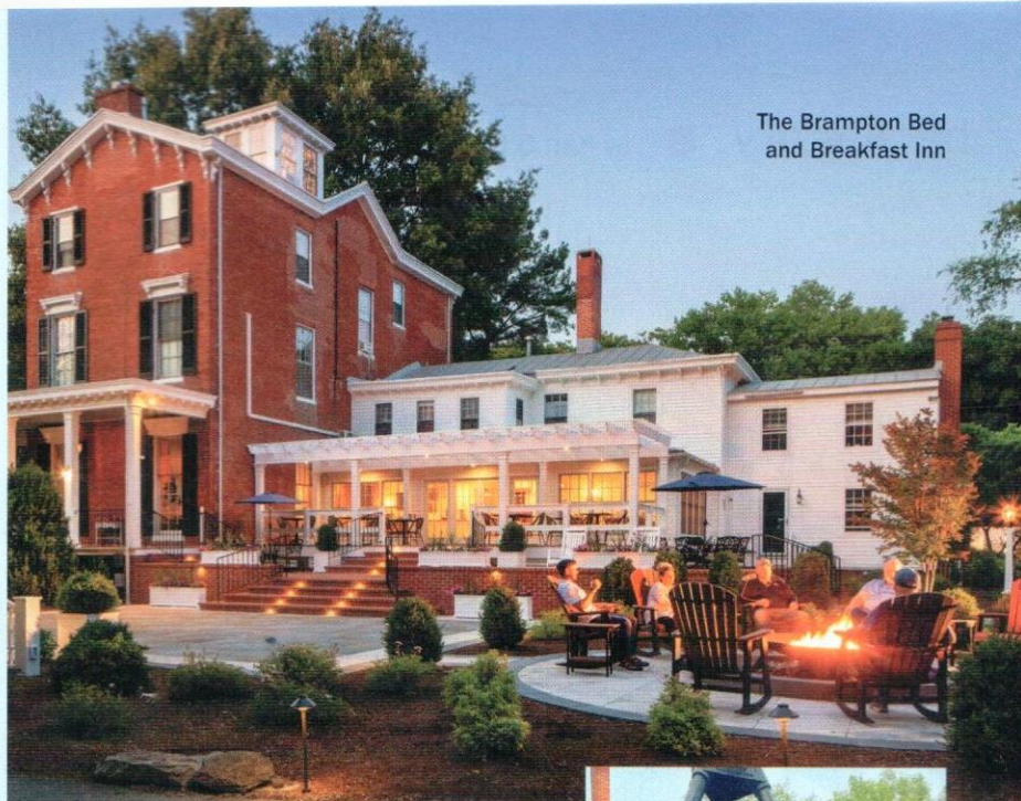
The Brampton Bed and Breakfast Inn

Bucks County Wine & Art Trail 215-639-0300, visitbuckscounty.com/wineandarttrail